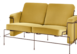
Frame: Sepia Brown 5016 Fabric: Yellow F-578 (453) Tablet: Anthracite Grey