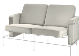
Frame: White 5011 Leather: Cream White L-0707 Tablet: White