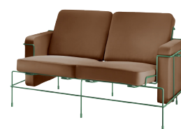
Frame: Dark Green 5021 Leather: Brown L-0112 Tablet: Dark Green