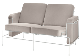
Frame: White 5011 Fabric: Beige F-266 (205) Tablet: White