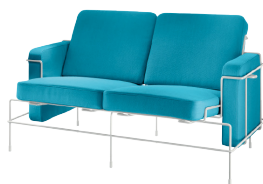
Frame: White 5011 Fabric: Turquoise F-227 Tablet: White