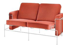
Frame: White 5011 Fabric: Orange F-088 (533) Tablet: White