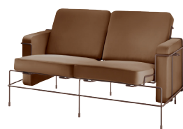
Frame: Sepia Brown 5016 Leather: Brown L-0112 Tablet: Anthracite Grey