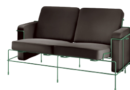
Frame: Dark Green 5021 Leather: Dark Brown L-0753 Tablet: Dark Green