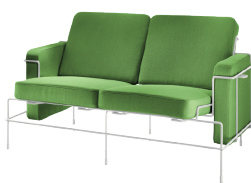
Frame: White 5011 Fabric: Green F-354 (953) Tablet: White