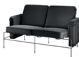
Frame: Black 5013 Leather: Anthracite Grey L-0065 Tablet: Anthracite Grey