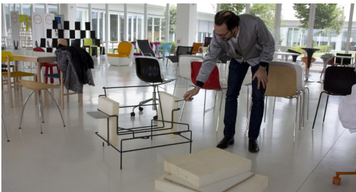
Designer in Magis

sofa, a bench in two versions, a chaise longue and an island. The collection has expanded further to include two low tables, one large, one small, and a high table, again with a metal rod frame, but with a top in artificial stone, adding another tactile sensation to the home and contract scenario.