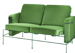
Frame: Dark Green 5021 Fabric: Green F-354 (953) Tablet: Dark Green