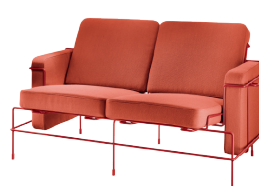
Frame: Signal Red 5019 Fabric: Orange F-088 (533) Tablet: Anthracite Grey