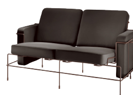
Frame: Sepia Brown 5016 Leather: Dark Brown L-0753 Tablet: Anthracite Grey