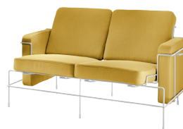
Frame: White 5011 Fabric: Yellow F-578 (453) Tablet: White