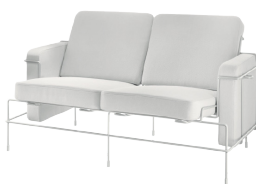
Frame: White 5011 Fabric: White F-737 Tablet: White