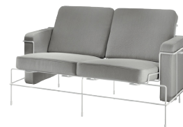
Frame: White 5011 Fabric: Light Grey F-741 (133) Tablet: White