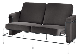
Frame: Black 5013 Fabric: Dark Brown F-521 (383) Tablet: Anthracite Grey