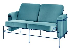
Frame: Green Blue 5017 Fabric: Light Blue F-222 (983) Tablet: White