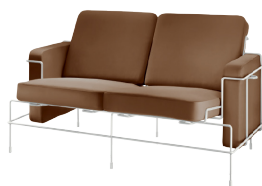
Frame: White 5011 Leather: Brown L-0112 Tablet: White