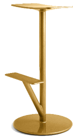
Matt colour Ocher