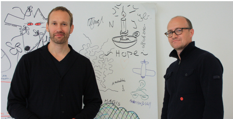
Designers in Magis