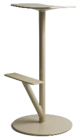
Matt colour White