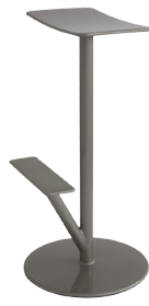
Matt colour Metallised Grey