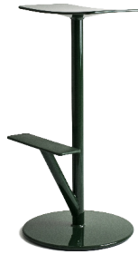
Matt colour Dark Green