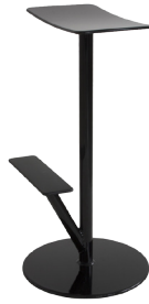
Matt colour Black