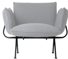
Frame: Black Cushions: Light Grey Divina Mélange 120