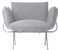
Frame: Galvanized Cushions: Light Grey Divina Mélange 120