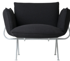
Frame: Galvanized Cushions: Dark Grey Rico 989.070