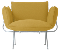
Frame: Galvanized Cushions: Ochre Azimut 400