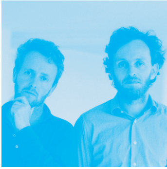
Ronan & Erwan Bouroullec

Ronan and Erwan Bouroullec have been working together for about ten years now. Their collaboration is a permanent dialogue, nourished by their distinct personalities and a shared notion of diligence, with the intention to achieve greater balance and refinement. The Bouroullecs have been working with Magis since 2004, designing two complete furniture collections as well as other projects. These days, Ronan and Erwan Bouroullec design for numerous manufacturers and they also continue to carry out their own experimental activity which is essential to the development of their work at Galerie Kreo, Paris, where four exhibitions of their designs