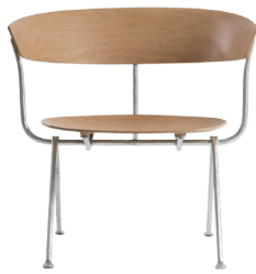
Frame: Galvanized Seat and Back: Natural Beech