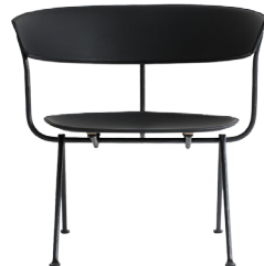
Frame: Black Seat and Back: Black Leather L-0060