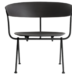
Frame: Black Seat and Back: Black Beech