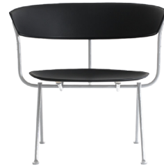
Frame: Galvanized Seat and Back: Black Leather L-0060