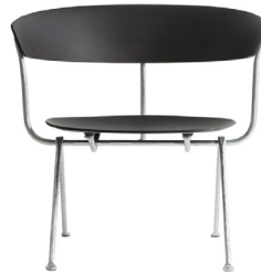
Frame: Galvanized Seat and Back: Black Beech