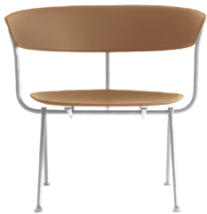
Frame: Galvanized Seat and Back: Natural Leather L-0090