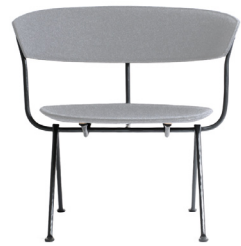
Frame: Black Seat and Back: Light Grey Divina Mélange 120