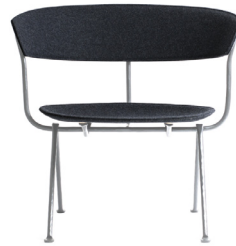
Frame: Galvanized Seat and Back: Dark Grey Divina MD (193)