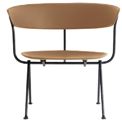
Frame: Black Seat and Back: Natural Leather L-0090