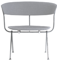
Frame: Galvanized Seat and Back: Light Grey Divina Mélange 120